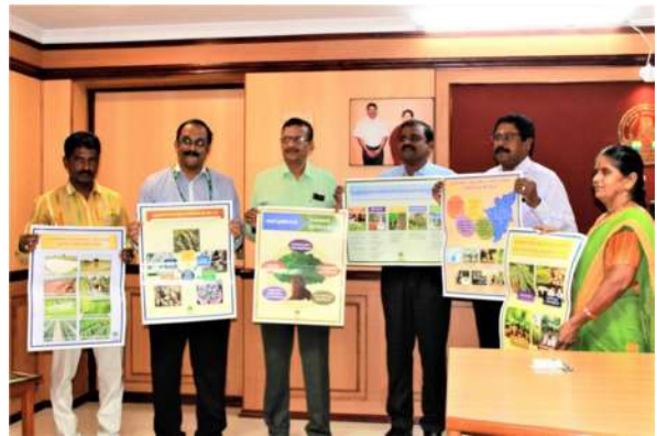
CLIMATE CAMPAIGN LAUNCHED BY THE DISTRICT COLLECTOR