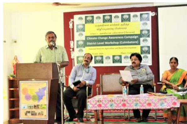
AEE, AED, Coimbatore